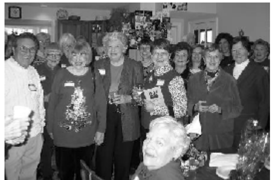
Festive crowd at last year's Holiday Lunch