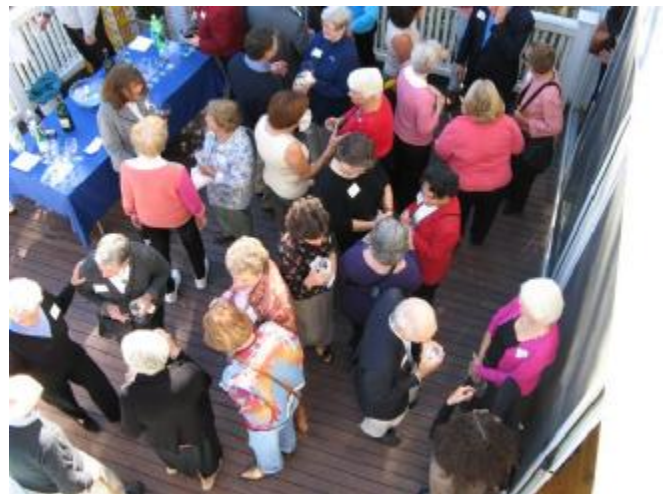
The crowd savors the sun and fine conversation at Fall Brunch.

The US Senatorial Debate is co-sponsored by The Advocate, Greenwich Time, The Business Council of Fairfield County, The Fairfield County Bar Associa- tion, The Local Leagues of Women Voters, The National Association of Indus- trial and Office properties, and News 12.