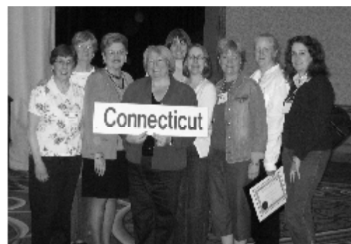
The Connecticut Delegation