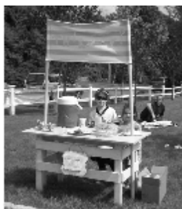
Future LWVers capitalize on the heat.