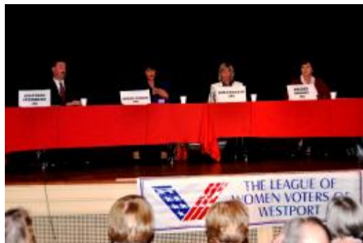
The State Representative Candidates Debate