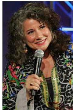
Laughter is good for you!

It's time again for the fall high school civics presentations known as The Power of One. We'll be at Staples this year on October 22, 25, 27, and 28. If you are interested in helping with this program, please contact Lisa Shufro at 221-1350 or lisa.shufro@gmail.com