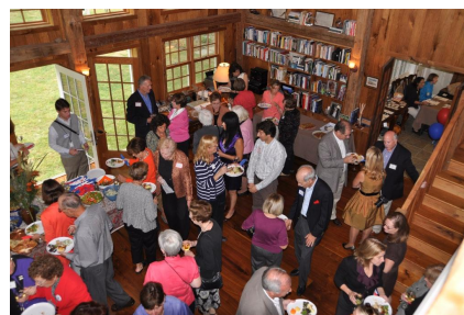
A view from the loft of the historic Weil home...